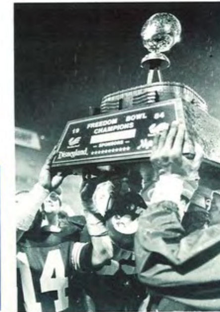
Iowa's Freedom Bowl triumph over Texas evens up the Hawkeye's bowl record in four years to 2-2.