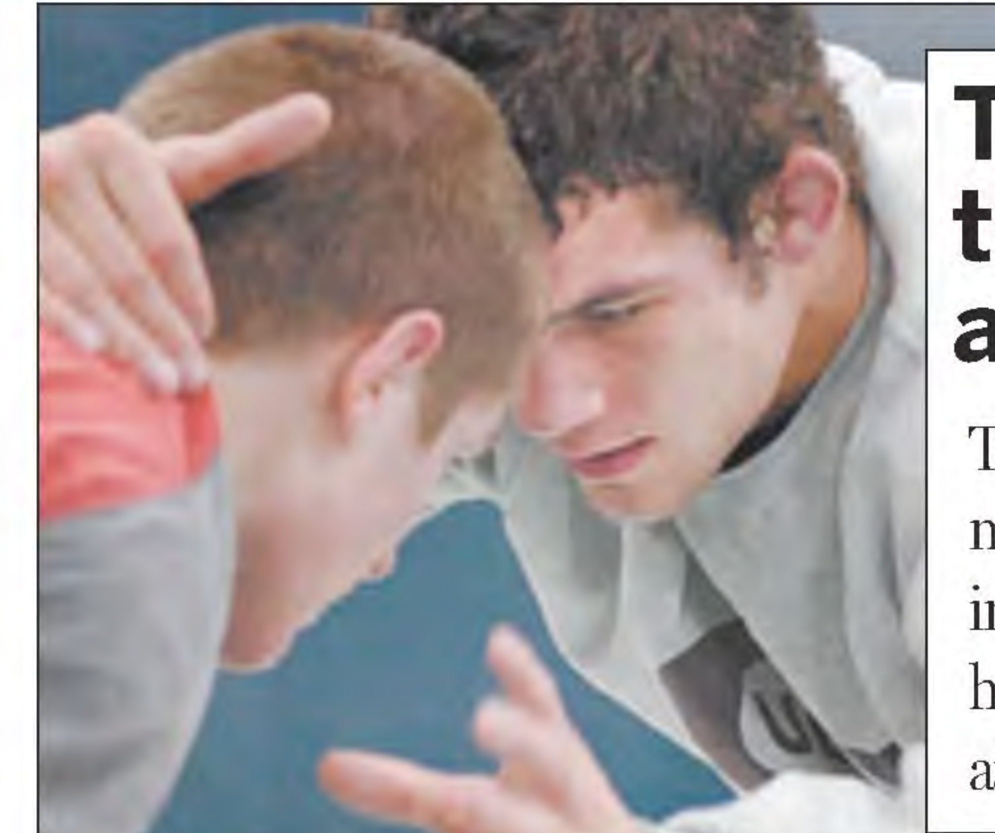
Time to get a grip

Team favorites, matches made in heaven and hard-luck tales at state. B6