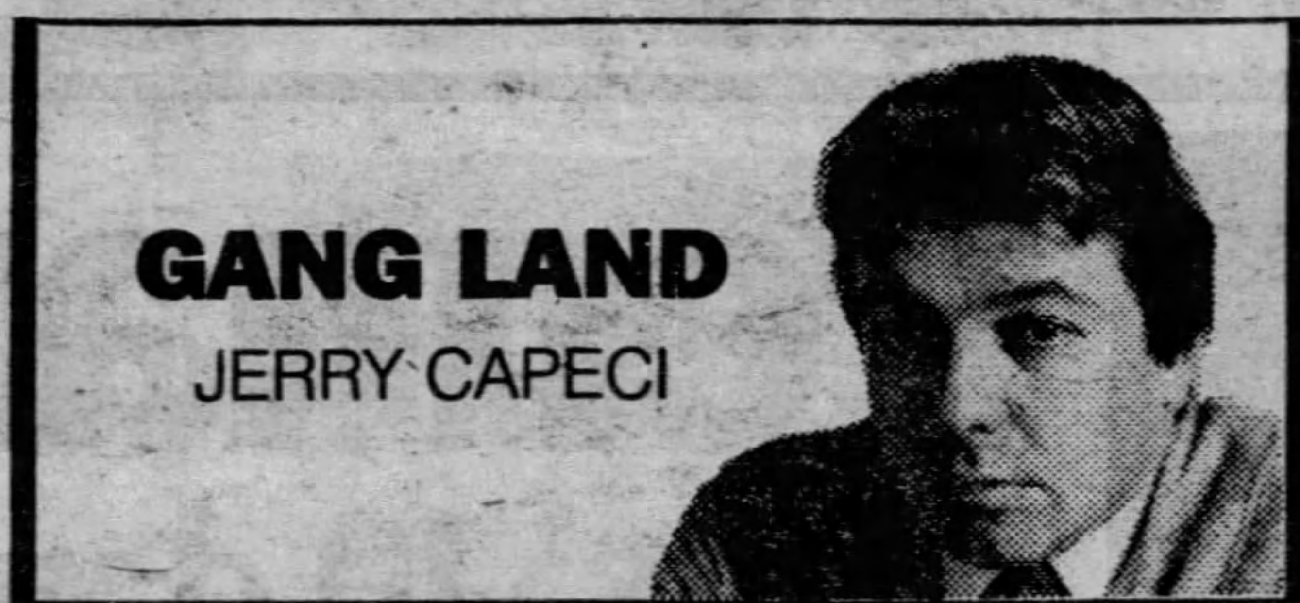
GANG LAND JERRY CAPECI