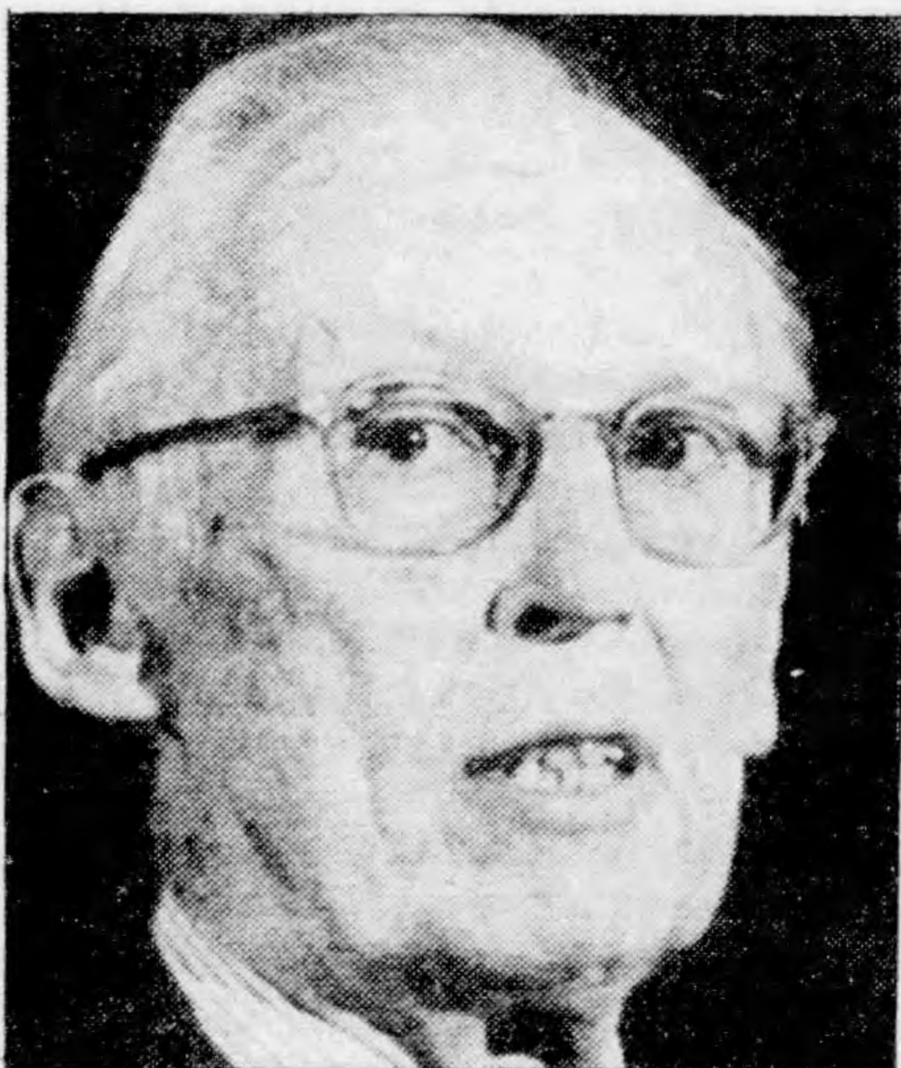
Former Justice Lewis F. Powell Jr.

Lewis F. Powell Jr. , a retired Supreme Court justice, is steadily improving from his bout with pneumonia, but doctors have not determined when he can leave the hospital, a spokeswoman said yesterday.