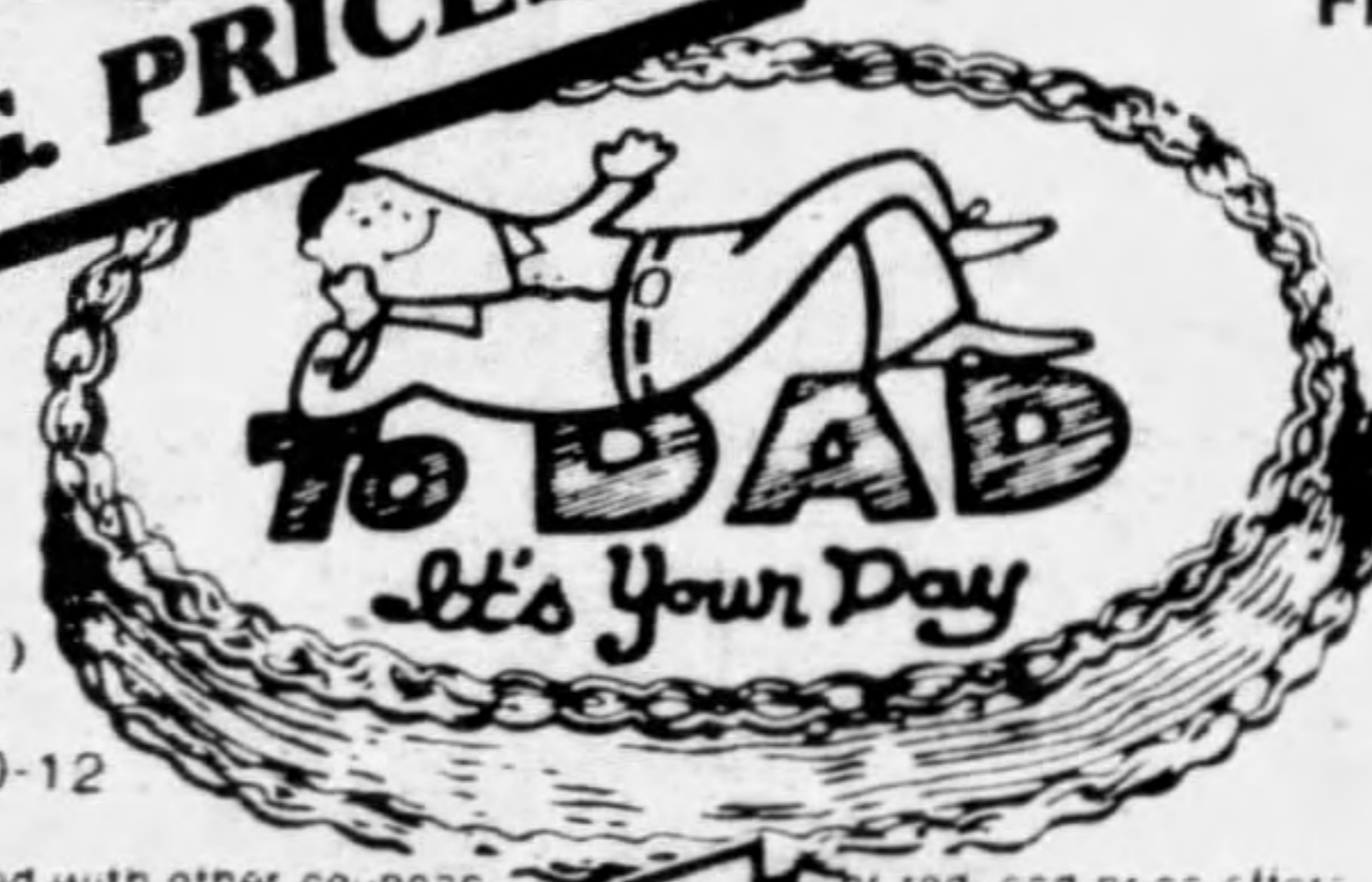
CAMEO CAKE Serves 10-12

Cannot be combined with other coupons or reduced price offers. Redeemable only at store listed in this ad thru June 21, 1987.