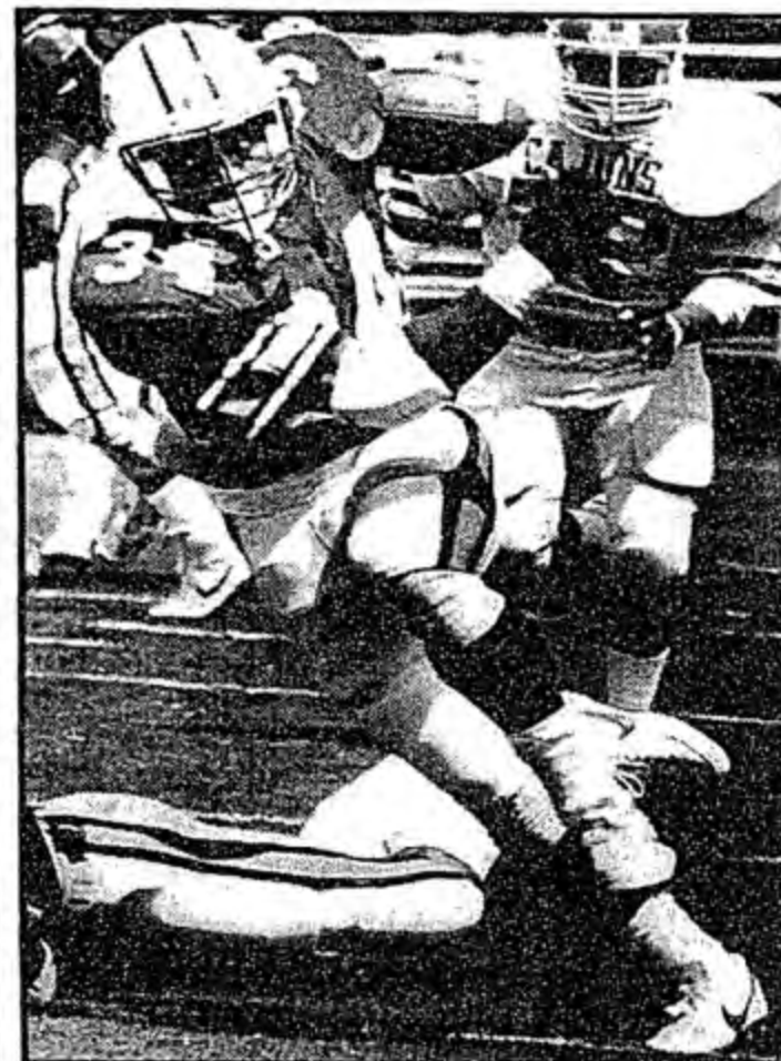
Vinny Testaverde, the Miami quarterback.