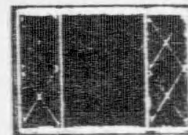
3 Lite Slider