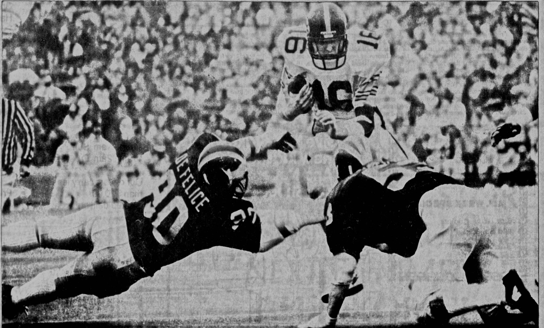
Iowa quarterback Chuck Long, center, looks for room to run at Sincich during early fourth quarter action of the Hawkeyes' 16-13 loss at Michigan Saturday. Sincich made the stop after long picked up four yards on the play. During the game, Sincich had four tackles while DeFelice had eight stops.